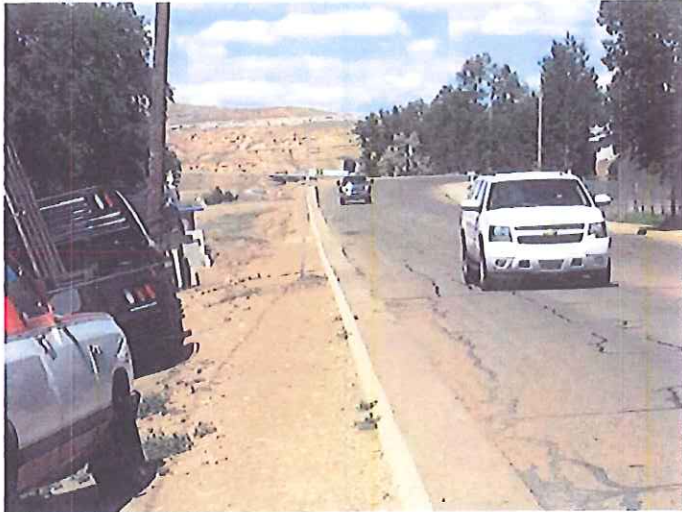
2 nd Street/James Drive.