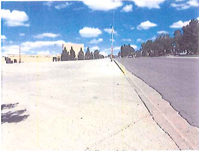
Rock Springs High School and parking lot