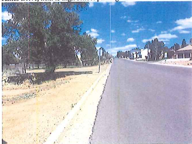
James Drive, next to proposed additional student parking off to left hand side of roadway. Residential housing to the right.